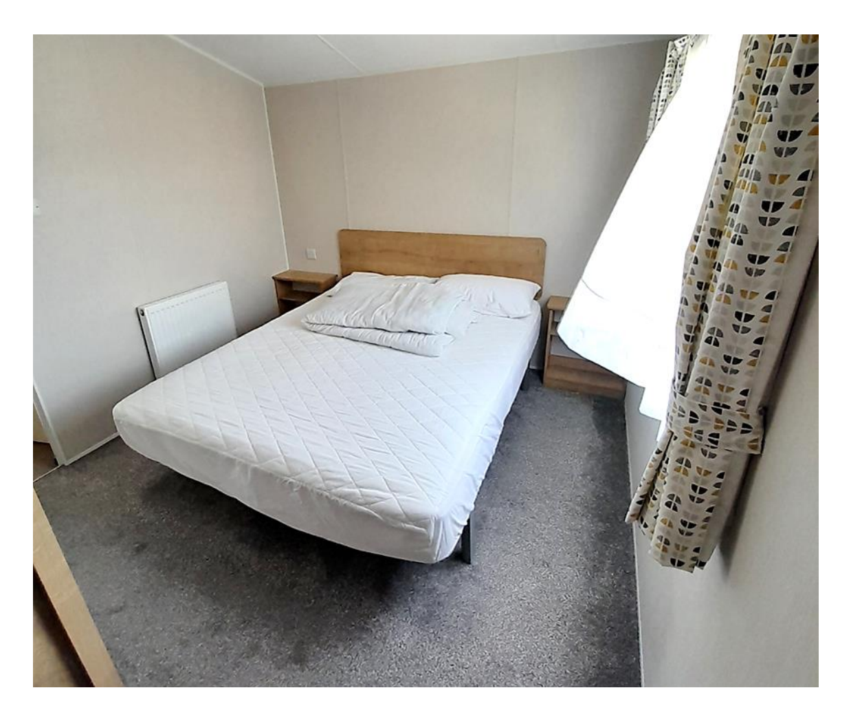
The main bedroom with king sized bed.

There is a television and DVD's, games, all the equipment that young families with babies and children might need, a true haven for them!