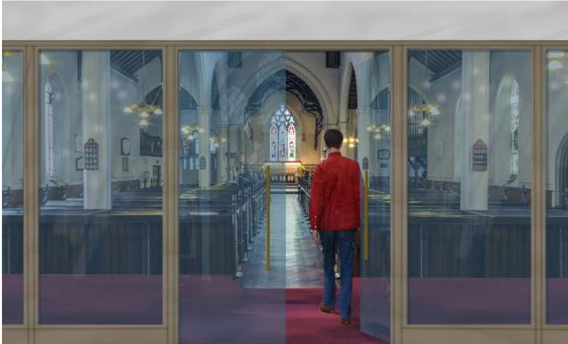
Proposed 'hall space', looking into the church through folding glass and oak doors.

The Fabric Committee are working with the architect on the faculty and related work to move forward with this.