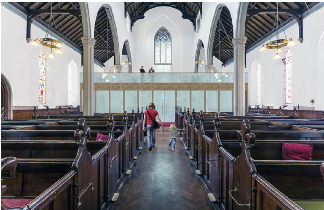
Proposed 'Gallery at West end, looking at the sliding glass and oak doors, with gallery above